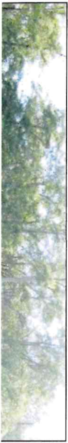
Photo Date: 10/08/2009